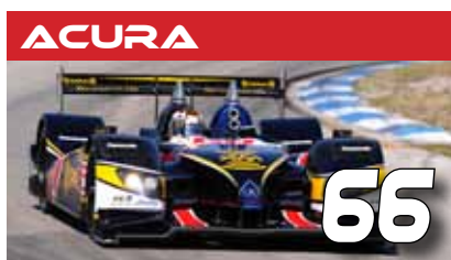
ACURA 66 de Ferran/Pagenaud/Dixon Michelin de Ferran Motorsports • Acura ARX-02a