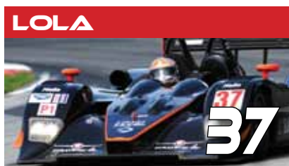
LOLA 37 J. Field/C. Field Dunlop Intersport Racing • Lola B06/10