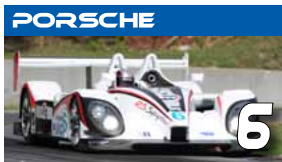
PORSCHE 6 Pickett/Graf/Maassen Michelin Team Cytosport • Porsche RS Spyder