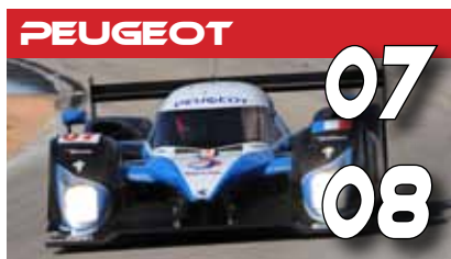
PEUGEOT 07 08 Minassian/Lamy Michelin Sarrazin/Montagny Team Peugeot Total • Peugeot 908 HDI FAP