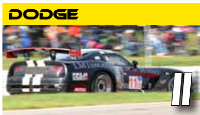
DODGE Feinberg/Hall Dunlop Primetime Racing Group • Dodge Viper Competition Coupe