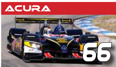
ACURA de Ferran/Pagenaud Michelin de Ferran Motorsports • Acura ARX-02a